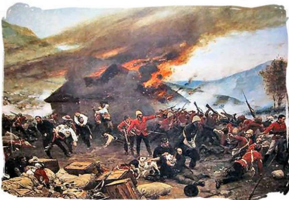
The defence of Rorke's Drift By Alphonse-Marie-Adolphe de Neuville (1879)