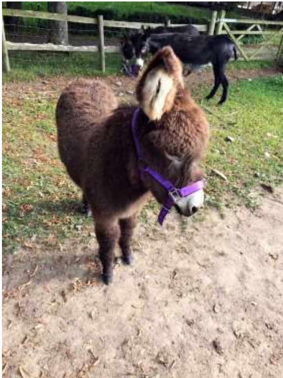
Poppy the baby donkey is official now. She has been microchipped and issued with a