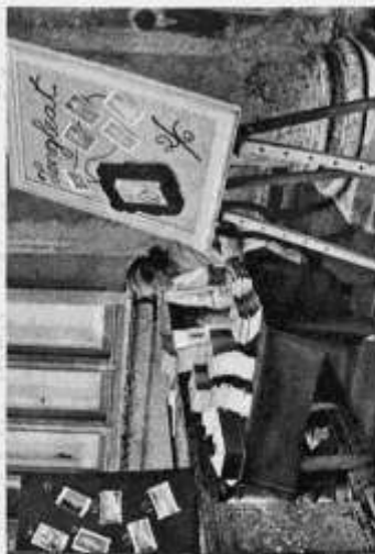
one of the finest private libraries in Europe. Here were feasted Elizabeth, Charles II and George III. The Duke of Monmouth sought shelter here in 1680, and Bishop Ken made it his home until his death in 1714. Lord Bath has been asked: "Do you want the public here?" and he has honestly said: "No, but I am faced with economic necessity."

in the queue. The Marchioness and members of the family share the task of describing each room to the public. Large car parks accommodate coaches and cars; while ice-cream vendors, "happy soap" men and traffic attendants make up a scene never before witnessed. Longleat was built between 1566 and 1580 by Sir John Thynne, and contains