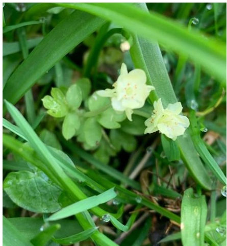
Town Hall Clock

Another of its common names is Town Hall Clock, so called because of the flowers that sit at the top of the stalk, four forming the (clock) faces of a cube and the fifth above.